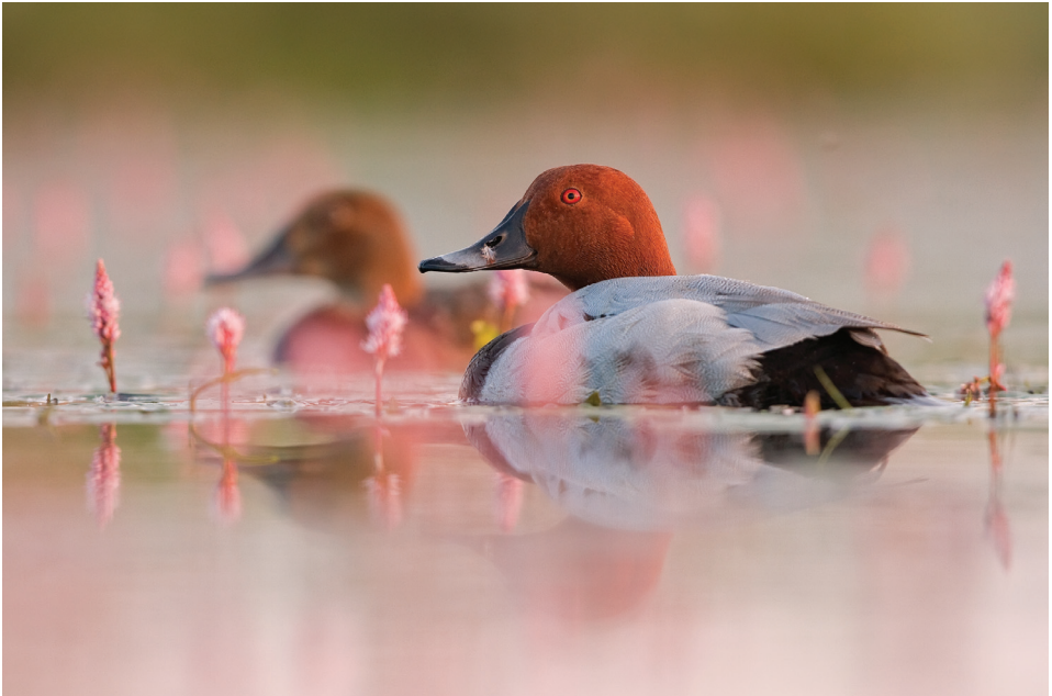
Photograph: Common Pochard male, with female in the background, at Jeziorsko, Poland, by Adam Mańka.

Wetlands International 2016. Waterbird Population Estimates . Wetlands International, Ede, The Netherlands. Accessible at: http://wpe.wetlands.org/ (last accessed 27 June 2016).